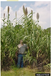
Arundo Donax—30 feet tall and spreading in our waterways

Through this grant they accomplished many workshops, trainings, community events, and watershed projects. Like many areas in California, resources are dwindling and populations are expanding. Pressures on the environment are intensifying as fuel