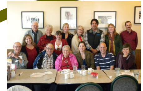
Meetings are held on the third Tuesday of each month at the Chowchilla Library. 300 Kings Avenue, Chowchilla, CA 93610

Central Sierra Watershed Committee Coarsegold RCD Sierra RCD Madera RCD Mariposa RCD Sierra/San Joaquin Weed Management Alliance California Association of RCDs CA. Department of Conservation Yosemite/Sequoia RC & D Madera Regional Water Management Group Oakhurst River Parkway Sustainable Forests & Communities Collaborative Joint Powers Agreement: City of Chowchilla Chowchilla Water District